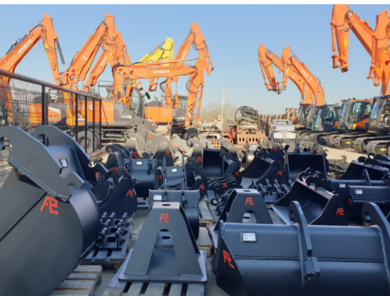
Globally active specialist for construction machinery: Founded more than 80 years ago, Pladdet B.V. is now producing high-quality equipment for excavators and wheel loaders.