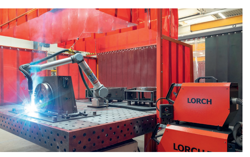
The entire welding machinery, including the Lorch welding Cobot that is mainly used to efficiently weld turbines made of manganese steel, is connected to Lorch Connect.