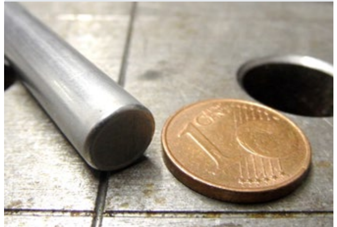
Tube \varnothing 8 x 0.2mm