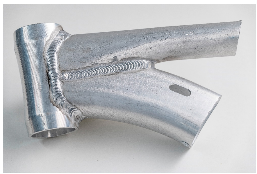
Bicycle frames, aluminium, roundseams