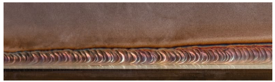
Comparison: TIG with additional stainless steel fillet weld 6 mm