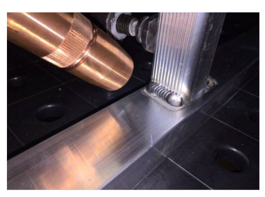
Aluminium railing frame