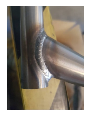
Bicycle steel frame