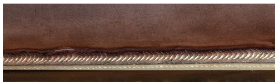
MicorTwin stainless steel fillet weld 6 mm